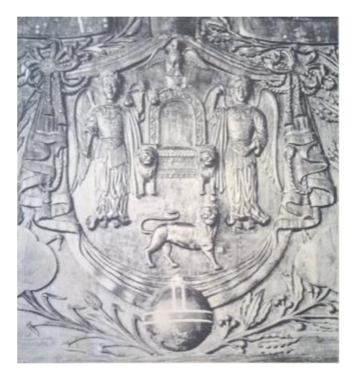
Fig. 2. "Negus Throne. Emblems of majestic power and smiling Justice". Primato , n. 6, y. 1, 1940, 5.