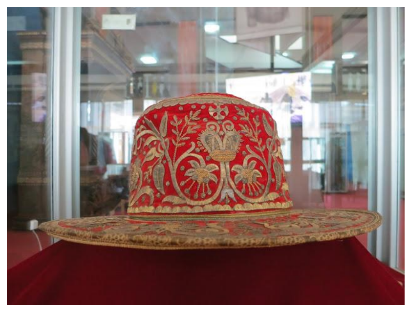
Fig. 4. Hat belonged to Menelik II. National Museum of Ethiopia.

information. The Museum is articulated in 4 sections (history and archaeology; modern age; anthropology; paleoanthropology) and its principal attraction is Lucy' skeleton, an australopithecus 3,2 million years old. The museum presents also a collection of modern paintings and the first floor guards several ceremonial robes as well as crowns and thrones. This is the section which interests us and fortunately we can use several videos to reconstruct the internal structure and the display layout<sup>18</sup>. The first floor of the Museum consists in a high ceiling room on which two higher floors lean out. This room guards numerous glass cases and inside one of this, with a decorated parasol with gilded inserts, we find a hat very similar to ours.