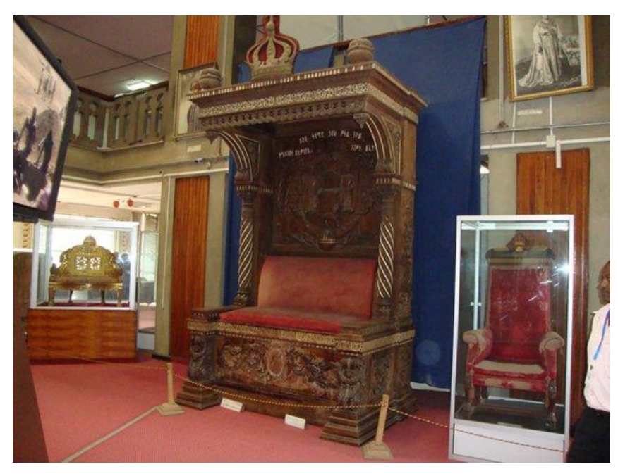
Fig.7. Panoramic view of the first floor of the National Museum of Ethiopia. Starting from the right: Empress Menen Throne; Hailé Selassié Throne; Empress Zewditu Throne.

Fig. 6. Throne of Empress Zewditu (1876 -1930) in the National Museum of Ethiopia. She was Menelik II's daughter and Empress of Ethiopia from 1916 to 1930.. The caption states that the throne was taken to Italy during World War II. Italy joined the war on 10 June 1940 and we know the throne was in the Colonial Museum in Rome at least in 1941, when the article written by G. Guida was written.